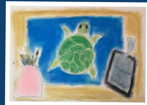
Seren L- Year 5