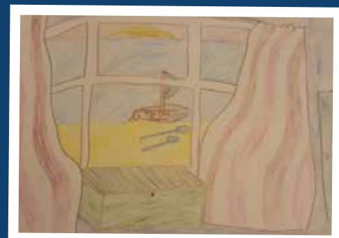
Rosie E - Year 5