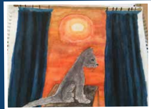
Ellenna C - Year 5